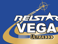
PREMIUM QUALITY HYDRAULIC OIL