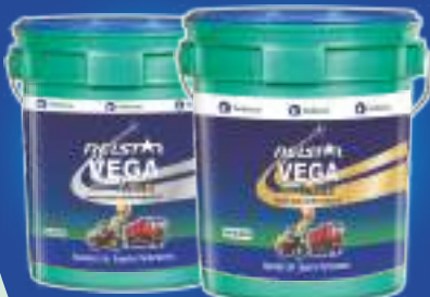
SUPERIOR QUALITY HYDRAULIC OIL